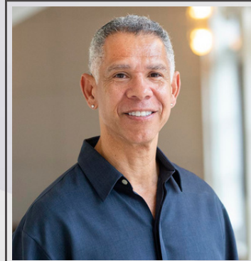
SCOT REESE SCHOOL OF THEATRE, DANCE, AND PERFORMANCE STUDIES